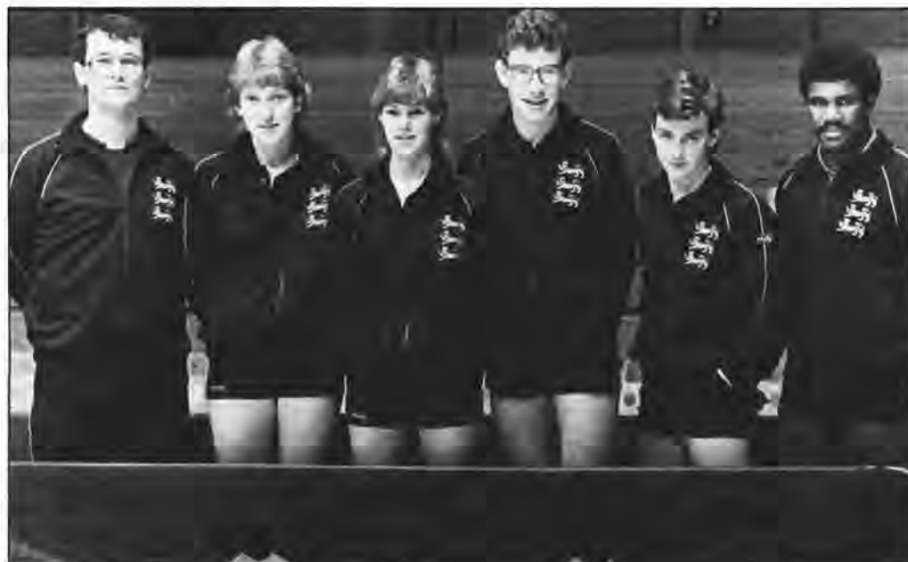
England's European League squad at Halifax

the Birmingham left-hander last lost two sets in a European league match!