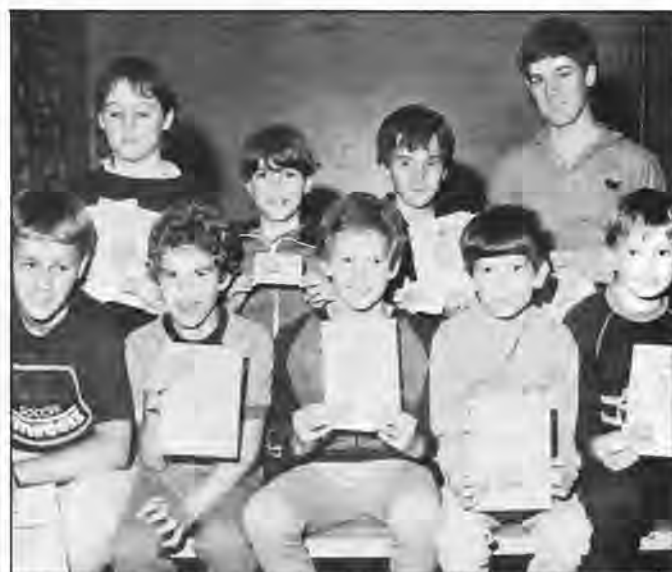
Some of the Swindon players with their Dunlop certificates and badges